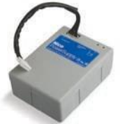
Ps124 24V battery with built-in battery charger