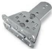
PIA14 screw-adjustable rear bracket