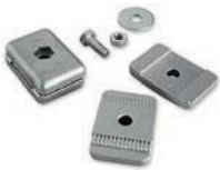
PIA13 travel stops for closing and opening manoeuvres