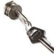
CM-B lock with two metal keys compatible with SELE