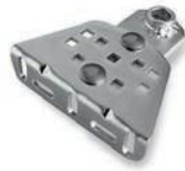
PIA15 screw-adjustable front bracket